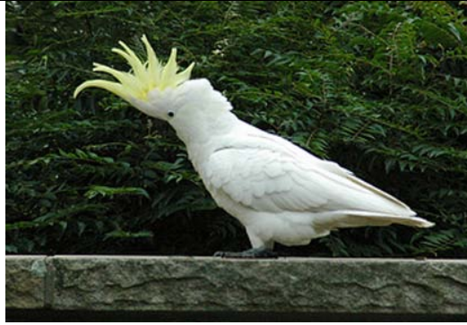
Abbott's cockatoo 7 , now only found on Masakambing Island in Indonesia, but abundant during the middle ages.

cockatoos, including the newly rediscovered and highly endangered Abbott's Lesser Sulfur Crested cockatoo.”