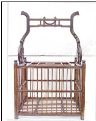
Qianlong era birdcage, 1735-1795 15