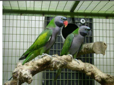
Male (left with red beak) and female Derbyan parakeets

“As the term “Asian parakeet” suggests for the genus Psittacula , the parakeets loved and adored by Europeans, with one exception, were natives to India and Southeast Asia 4 and therefore became natural parts of aviculture throughout the continent. In China, the native parakeet was the Derbyan, a violet breasted bird of great beauty not kept in European aviculture. “