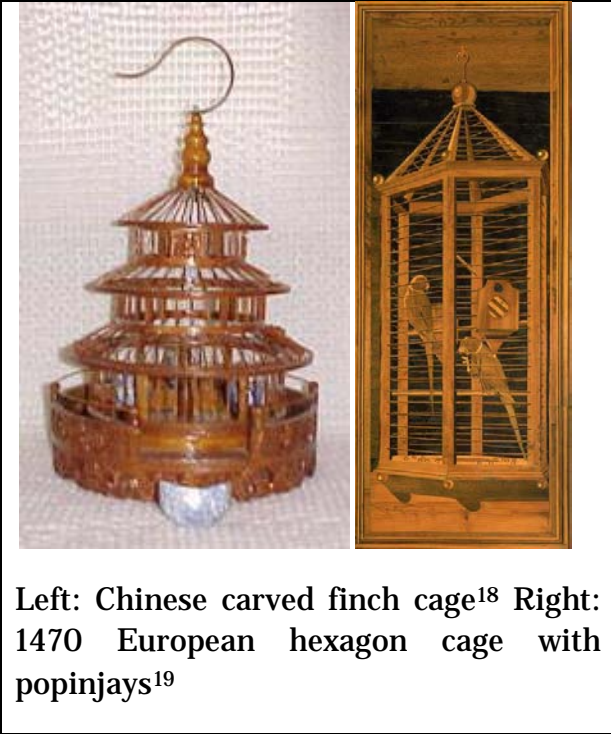
Left: Chinese carved finch cage 18 Right: 1470 European hexagon cage with popinjays 19