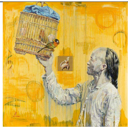
Manchu bannerman, 18 th century with finches 16