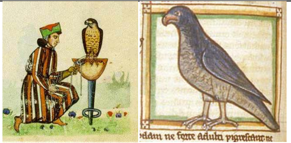
Left: A peregrine falcon with her falconer in the middle ages on a block perch. Right: A peregrine falcon from a 1236 manuscript. 9