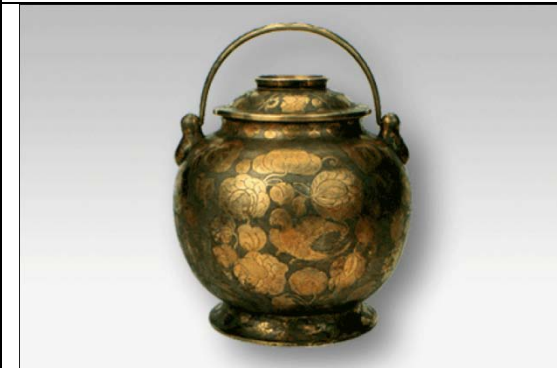
Tang dynasty pot with (Derbyan) parakeet design 13

Instead, the animals that humans turned to for companionship in period were their companion birds. 14 These parrots, finches, canaries, pigeons, doves, and other members of the three aforementioned orders of birds kept members of the household company while engaging in the often repetitious day to day work of the household or keep like spinning, weaving, sewing, or washing. Pigeons, doves, and some parrots love to be held and cuddled while it was the color and song of the finches, canaries, and parrots that brought value to their companionship. Parrots of all sizes enjoy interactive games with their human flock members. And of course, many species of all these became prestige animals with the rarer and harder to obtain birds becoming the quests of the upper classes as methods of attaining social stature among each other. This was part of the point behind the royal menageries kept by many kings and emperors—the precursors to the modern zoos.