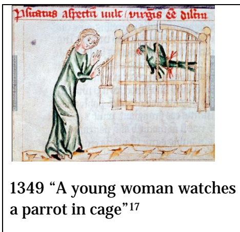
1349 "A young woman watches a parrot in cage" 17

Contrary to perhaps popular perception, keeping a bird in period was not difficult. All that was required was reliable shelter from the elements and extremes of temperature, a steady supply of food and water, and healthy clean air. Caging requirements depended on the species with the cage often being the most lethal component of a parrot's living environment due to metal toxicity and the strength of their beaks making an escape proof wood cage nearly impossible to construct. Oftentimes no cage at all was provided to parrots by those who wished to provide the longest life for their birds—the family bird lived as part of the family. Whereas for finches and other songbirds, wood or bamboo cages usually either in a