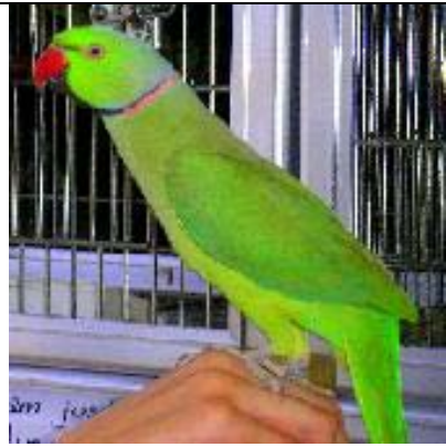
Male Indian Ring neck parakeet