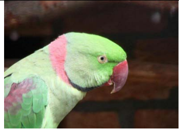
Alexandrine male close up