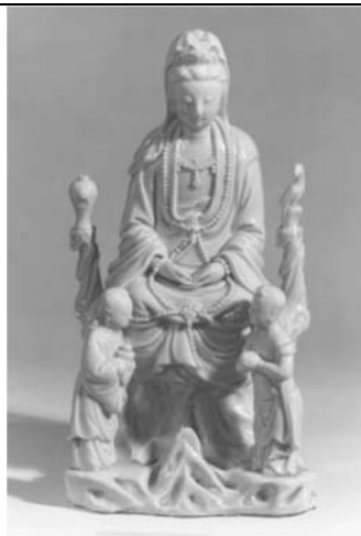
17 th century Guanyin with cockatoo on her left shoulder 25

Placement this close to Mary was a sign of reverence and respect. With Mary came a close association between the popinjay and women. Since women's work involved being indoors with the family bird