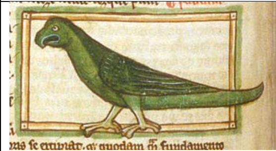
1236 manuscript rendering of a popinjay—a Psittacula parakeet. 12