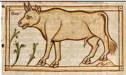
Ox from 1236 manuscript 10

In medieval societies, there were no such things as “pets” in the modern sense of the word—all animals had a function. Dogs were kept for hunting, vermin control, herding, even assistance in mountain and arctic survival tasks. Cats, which were barely tolerated and far less favored, when they were valued at all, were recognized for their vermin control abilities. Farm animals provided transportation, labor, fiber for clothing, and their bodies for consumption. Raptors were kept as hunting animals. These were not social animals. Even if some sort of attachment was formed, it was understood in all these cases that the primary purpose of these animals was to do a job. Our modern norm of the pampered pooch that relaxes and lives a life of leisure and comfort indoors with nothing to do except receive human attention was the exception to the norm in period.