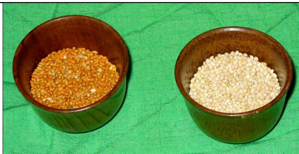
Left: red millet Right: white millet

Largely, the fruits and vegetables available in Europe and Asia were the same by the middle ages. That is, the flow of goods, including foods, had spread both directions so that foods that started out in only Asia or only Europe were now being cultivated in both places by the year 1200 or even 1400 in some cases. Some fruits like the strawberry took time to spread from their small localized areas to the rest of Europe, but foods had a way of spreading.