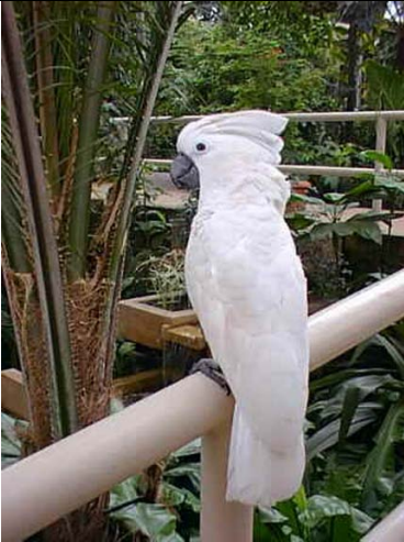
Umbrella cockatoo from Indonesia 6